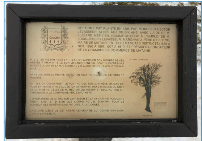
The above text is a translated version taken from a text inscribed on a plaque located in downtown Matane that tells the story of the Levasseur Elm tree..