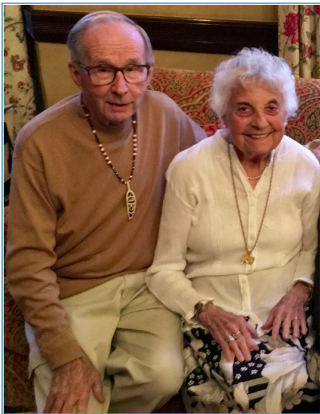
Here we are, a bit older, slightly wiser, and still in love!