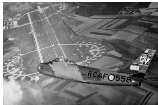
RCAF Sabre Jet flying over the Marville military base in 1950

It appears that "the soft sea" (belle mer pronounced as belle-mère in French) had followed us to the dark clouds of Europe for a new adventure. With the road to the