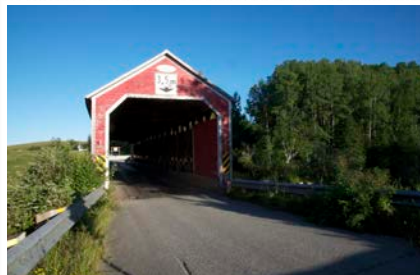
The Levasseur covered bridge at Authier-nord